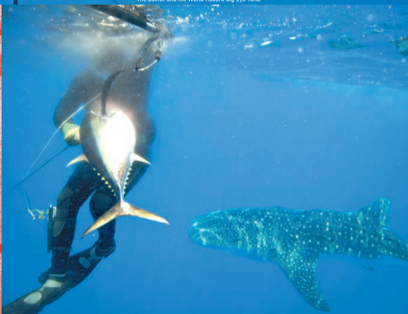
Fighting fish whilst dodging whale sharks is the norm in the Boiling Sea.

I have just returned from one of the most amazing and successful blue water freediving expeditions I could ever imagine. As a dedicated blue water freediver and spearfishing charter operator I am always on the look out for a new destination or a new frontier. Fortunately, I have just discovered the blue water spearfisherman's El Dorado.